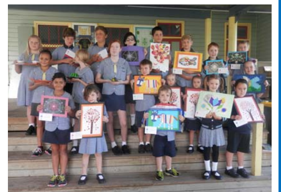
Maclean Show Award Winners—Congratulations!