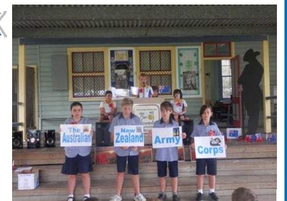
Anzac Day Service Assembly