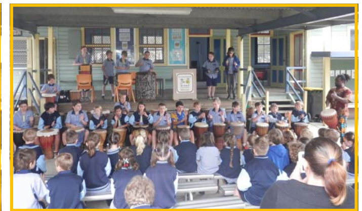
Education Week Performances