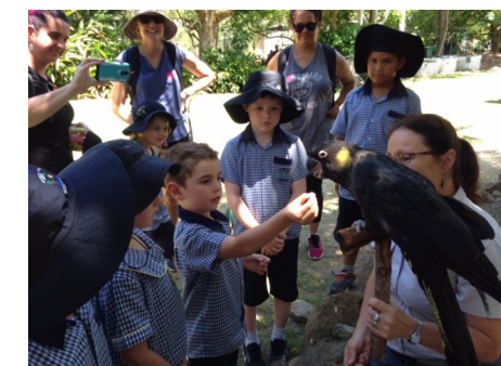
K/1 on Excursion to Currumbin Wildlife Sanctuary