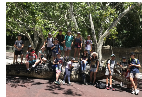
5/6 at Australia Zoo. Excursion to Brisbane/Gold Coast

We have had one reported case of Molluscum which is a skin problem. If you are concerned please look up the Kids Health website at