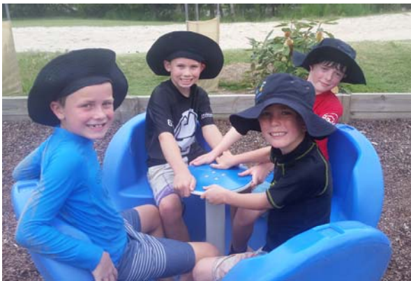
Class Parties at The Big 4