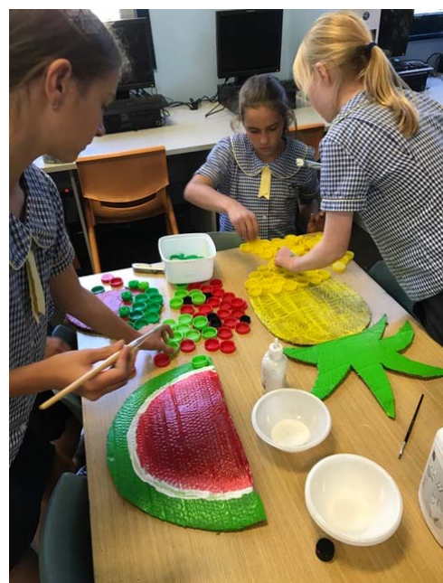
Creative Arts students busy designing fruit to be displayed at the canteen